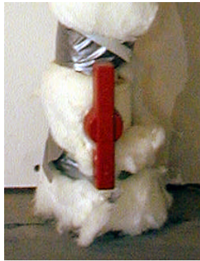
Main Water Shutoff Valve

There is a main water shutoff valve typically located by your water heater. This will shut off all the water going into your home. It can look like one of the two pictures below.